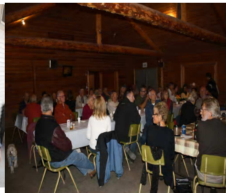
Volunteer Appreciation Night October 6th. All 2010 Volunteers will be named on a plaque on the Donors Board at the Station