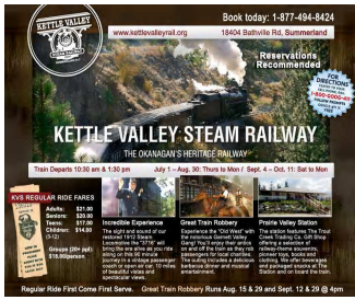
I Screen World Pop Screen (above) and Touch Screen for the KVSR